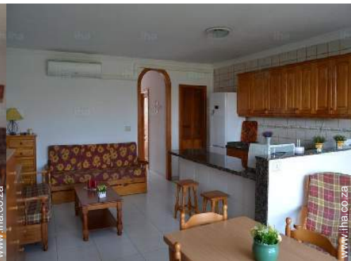
sofa bed(s) 2 pers