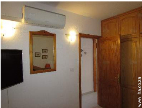
fully air conditioned