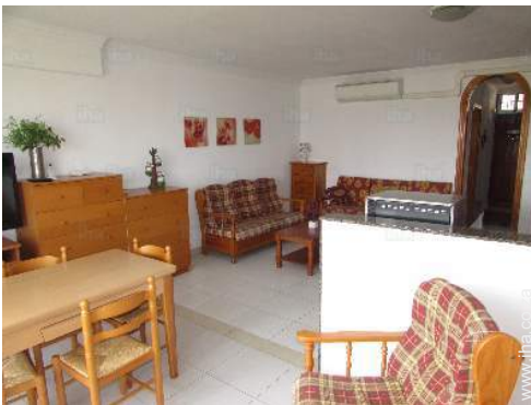
fully air conditioned