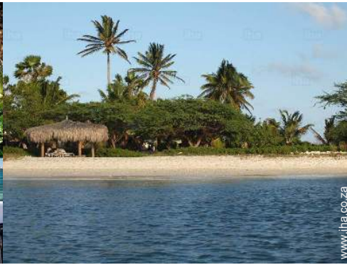
view over the ocean