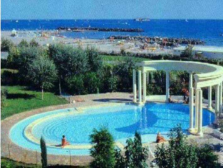
Oval swimming pool