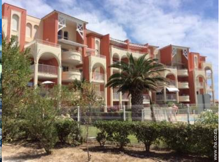
block of flats