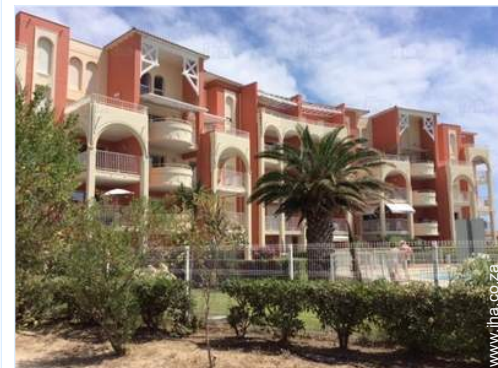
block of flats