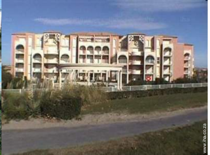
block of flats