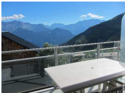
view from the flat