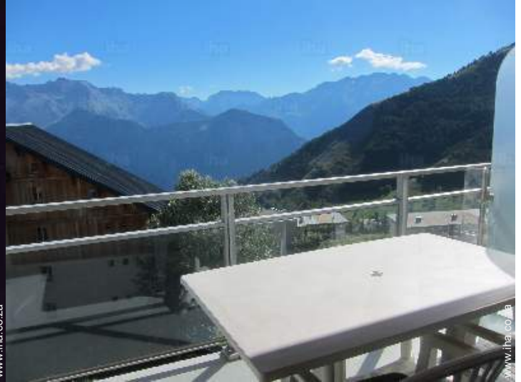
view from the flat