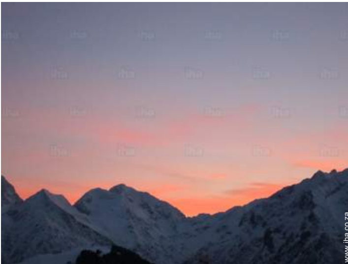
view from the flat