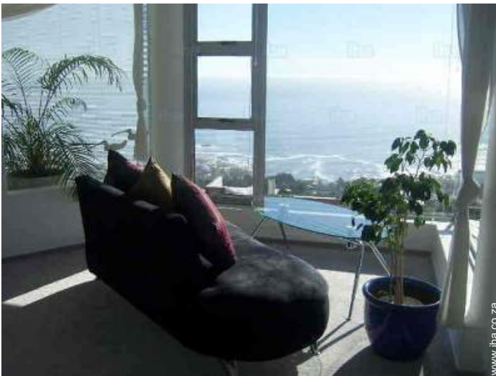
view from the bedroom