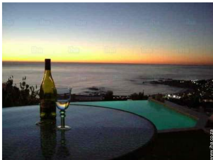
view of the sunset