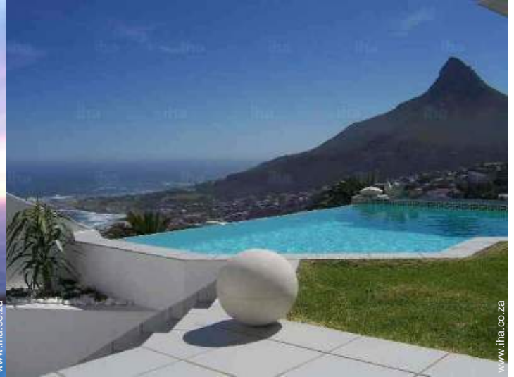
view from the patio