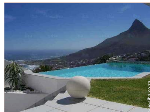
view from the patio