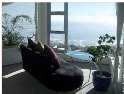
view from the bedroom

Children welcome Non smoking rental, mobile telephone network coverage Water : hot/cold Local voltage supply : 220-240V / 50Hz Electricity supply : mains