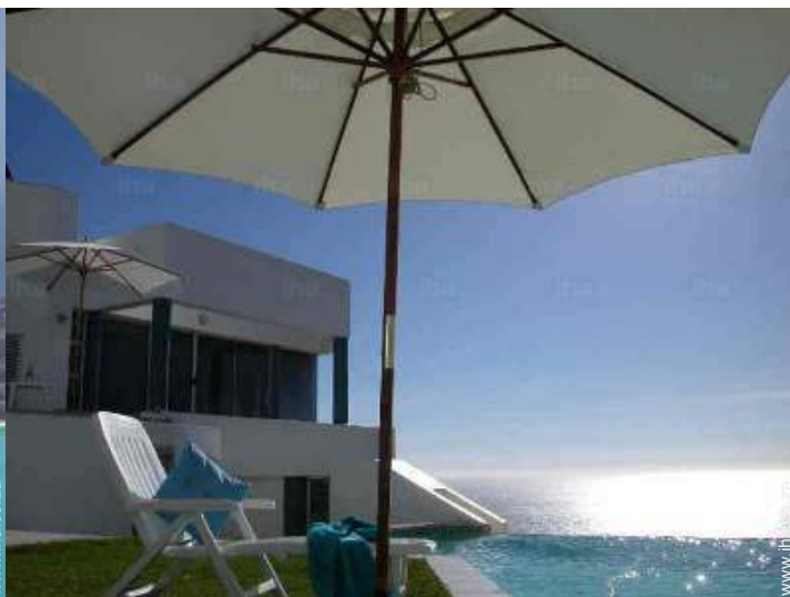
view from the swimming pool